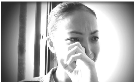
Tobes becomes emotional as she says she didn't expect her mom would show up at her coronation.